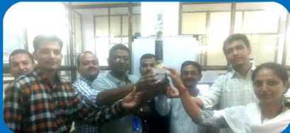
India - Inbound Sales Team