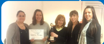
Ruislip – Best Team: QC