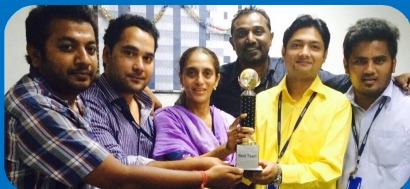
Perivale – Best Team: European Buyers